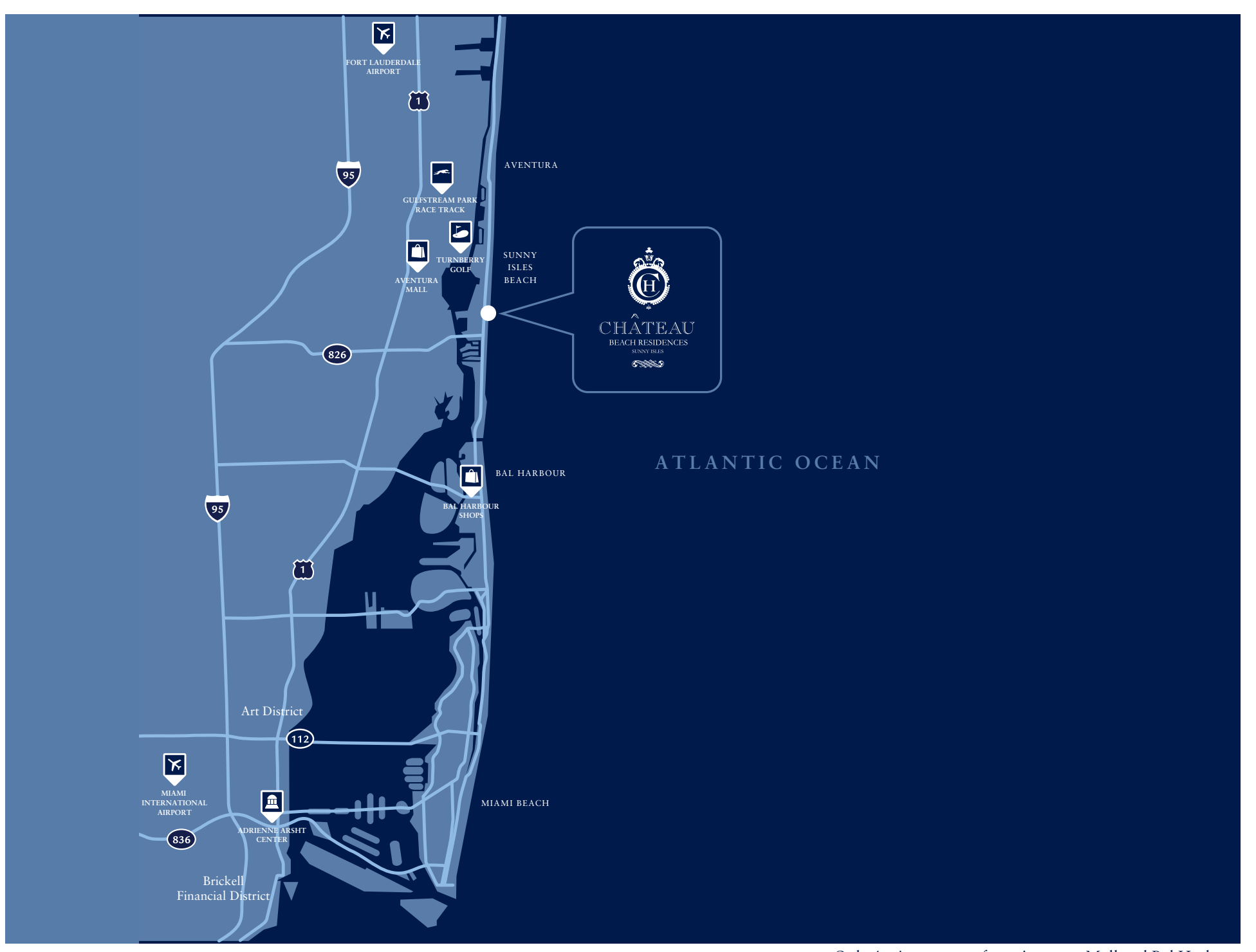
Only 4 minutes away from Aventura Mall and Bal Harbour